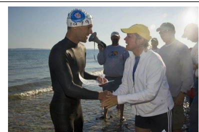
Finish line greetings from the Governor!

Skip ahead to the next Labor Day – it's the first Mighty Mac Swim . Governor Granholm shakes the hands of 50 swimmers getting out of the water after successfully crossing the Straits of Mackinac! Two swimmers did not complete the swim, but a 3-person relay team