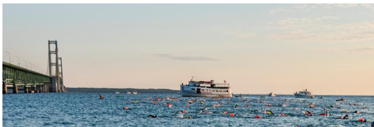
The 2019 Mighty Mac Swim started with a sunrise cruise, followed by a jump from deck and swim ashore to cross the starting line and begin following the Mackinac Bridge across the Straits.