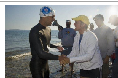
Finish line greetings from the Governor!

Skip ahead to the next Labor Day – it's the first Mighty Mac Swim . Governor Granholm shakes the hands of 50 swimmers getting out of the water after successfully crossing the Straits of Mackinac! Two swimmers did not complete the swim, but a 3-person relay team